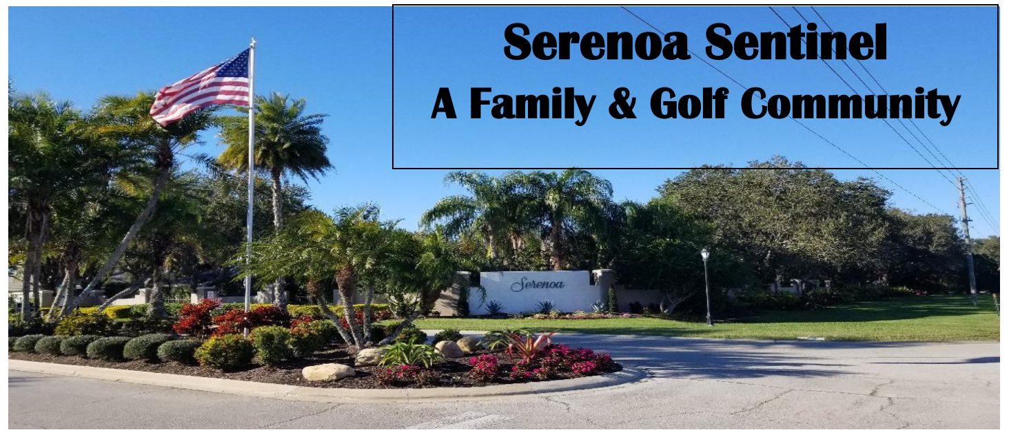
Published by The Serenoa Community Association